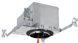
Max. Adjustability IC Airtight New Construction Housing