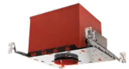
2-Hour Fire Rated IC Airtight Housing

3" Housing EL390RICA 4" Housing EL490RICA