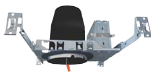
Standard IC Airtight New Construction Housing