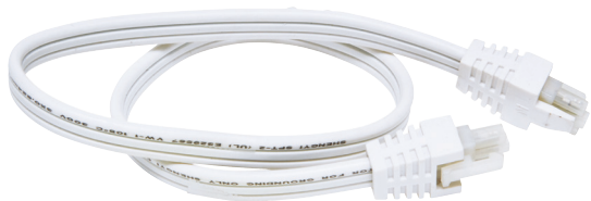
6" Linking Cable EUDC31