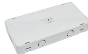
Junction Box w/ ON/OFF Switch EUDJBX

Please provide your e-mail address to salesadmin@elcolighting.com To unsubscribe e-mail: salesadmin@elcolighting.com All other standards, terms and conditions apply.