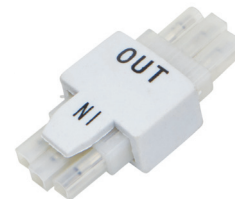
End-to-End Connector EUDCS31