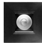
Square All Black