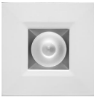
Square Haze w/White