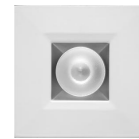
Square Haze w/White