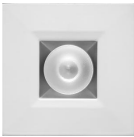
Square Haze w/White