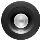
Round All Black