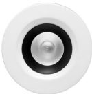
Round Black w/White