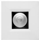
Square Black w/White