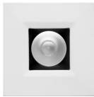
Square Black w/White