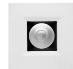
Square Black w/White