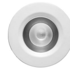
Round Haze w/White