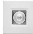
Square Haze w/White