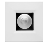
Square Black w/White