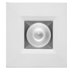
Square Haze w/White