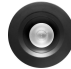
Round All Black