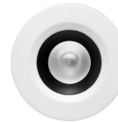
Round Black w/White