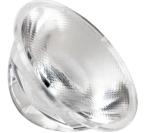
EP713C - EP715C