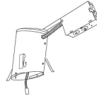
4" Sloped Ceiling Housing Remodel