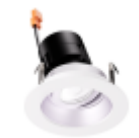
Haze Reflector with White Ring