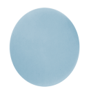
L52 - BLUE