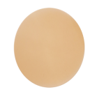
L51 - Color Shifter