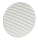
L46 - Linear