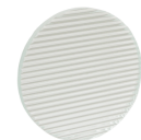
L55 - Double Asymmetric Herculux Lens