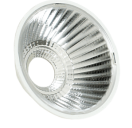
EP735C - EP738C