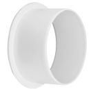
L50W - White Snoot