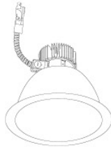
Reflector Trim E910L