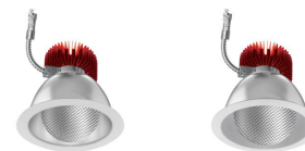
Haze w/White Ring