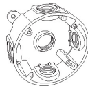
4" Round Surface Mount Box

4" x 4" x 1 1/2" 4" x 4" x 2 1/8" 3 1/2" x 3 1/2" x 1 1/2"