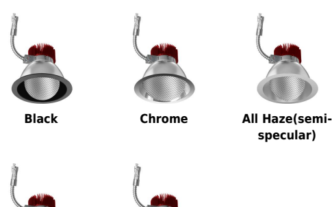
850 lm - 3000 lm Series