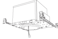
6" ICA Housing New Construction