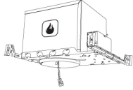
2-Hour Fire Rated 6" ICA Housing New Construction