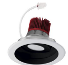
Black w/White Trim