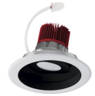
Black w/White Trim