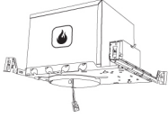
2-Hour Fire Rated 6" ICA Housing New Construction