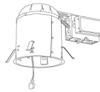
6" Non-IC Housing Remodel