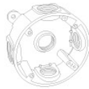
4" Round Surface Mount Box