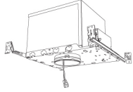
2-Hour Fire Rated 4" ICA Housing New Construction