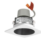
Black w/White Trim