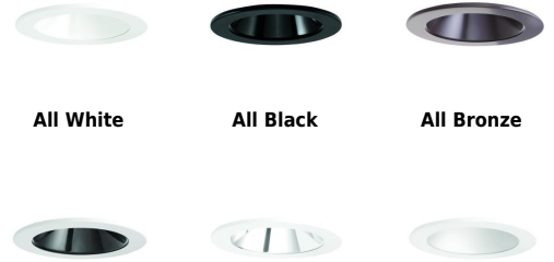
All White All Black All Bronze Black w/White Trim Chrome w/White Trim Haze w/White Trim