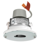
Black w/White Trim