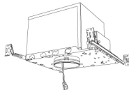
2-Hour Fire Rated 4" ICA Housing New Construction