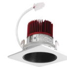
Black w/White Trim