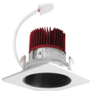
Black w/White Trim