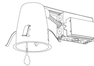
4" Non-IC Housing Remodel