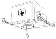
2-Hour Fire Rated 3" ICA Housing New Construction