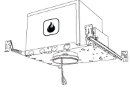
2-Hour Fire Rated 3" ICA Housing New Construction