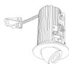
E2L97 Series Pull Down Finishes: (W, BZ, BB)