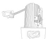
E2L19 Series Square Adjustable Finishes: (W, BZ, BB)