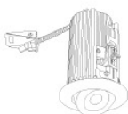
E2L18 Series Round Adjustable Finishes: (W, BZ, BB)