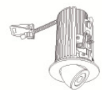
E2L97 Series Pull Down Finishes: (W, BZ, BB)