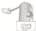
E2L19 Series Square Adjustable Finishes: (W, BZ, BB)