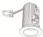
E2L10 Series Round Reflector Finishes: (W, BZ, B, C, H, BB)