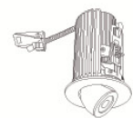
E2L97 Series Pull Down Finishes: (W, BZ, BB)