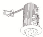
E2L18 Series Round Adjustable Finishes: (W, BZ, BB)