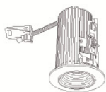
E2L14 Series Round Baffle Finishes: (W, BZ, B, BB)