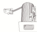
E2L15 Series Square Baffle Finishes: (W, BZ, B, BB)