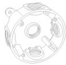
4" Round Surface Mount Box