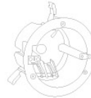
3 1/2" Round Old Work (Non-Metallic)