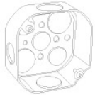
3 1/2" & 4" Octagon Steel Junction Boxes