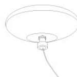
Track Pendant Kit

Track pendant kit with 60" stainless steel cable. 1/16" stranded