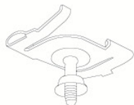
T-Bar Attachment Clip

Allows track to be attached to inverted T-Bar ceiling. Order as follow: (2) clips for 2' or 4' track, (3) clips for 6' track, (4) clips for 8' or 12' track