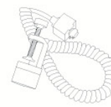
Clamp Cord and Track Adapter

Connects to Line Voltage track. Includes female track connector for attaching a Line Voltage fixture