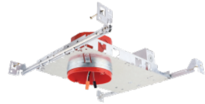
For 4" 0-10V LED Inserts (EL495 Series)

Maximum 2-Hour Fire Rated ceiling assembly can be maintained when installed according to the International Building Code, Section 714.